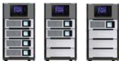
19U Rack with Display